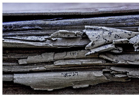
(fig. 1) Yuri Dojc, “Book Fragments, ‘Hanishar’”, Bardejov, 2006

As an artist myself, I was especially moved by the still life images of cultural objects and spaces in Last Folio. Dojc’s documentation of books, synagogues, and cemeteries, spoke to Slovakian Jewish history and, by extension, Eastern European Jewish history, in a way that is uniquely their own. By showing us these photographs of objects and places that have by now returned to dust, have crumbled away, or have been buried beneath the earth, Dojc is able to paint a portrait of Slovakia’s Jewry by manner of omission; it is precisely in our search for people and faces in these photographs of Slovakian Jewish life that we are made acutely aware of what has been lost.