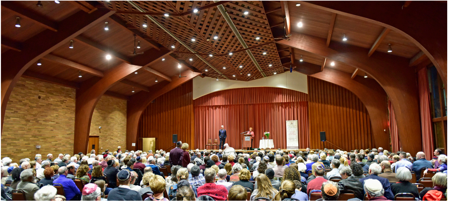
Amazing turn-out to hear Professor Lipstadt

His most recent work, Night Without End: Fate of Jews in Selected Counties of Occupied Poland , was published in April 2018, in Warsaw in Polish. His forthcoming book, The Role of the Polish “Blue” Police in the Extermination of Polish Jewry , is scheduled for publication shortly.