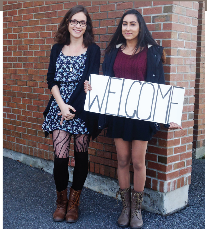
Two students from Cairine Wilson Secondary School holding up welcome signs.