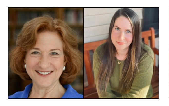
Inspired by Correspondence: Letters that Survived and Tracing a