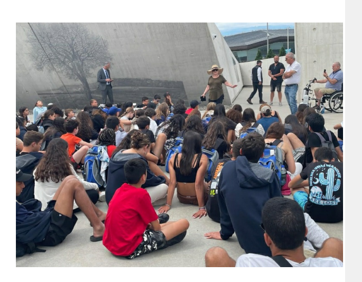
Students from Israel visiting the National Holocaust Memorial.

The National Holocaust Monument, entitled Landscape of Loss, Memory, and Survival, is situated in Ottawa, but stands as a reminder to all Canadians "to ensure that the lessons of the Holocaust as well as the contribution Holocaust survivors have made to Canada remain within the national consciousness for generations to come."