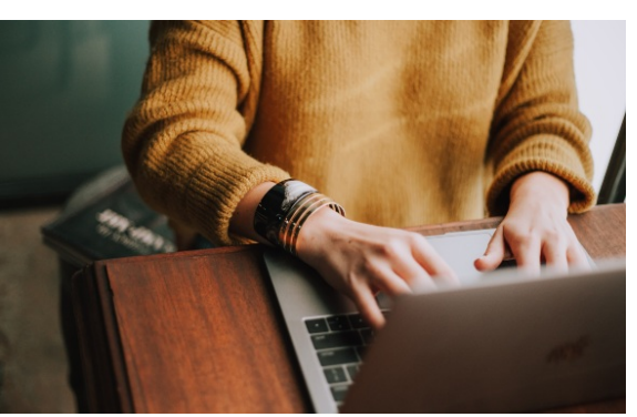
CHES' annual Teachers' Workshop will be open to teachers