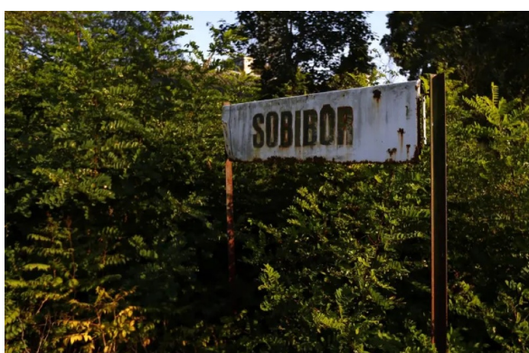
Tracks leading to the Sobibór railway yard.

Hundreds of Ottawa’s Jewish community came together on November 6 th to participate in the first annual RISE UP Ottawa event. The immensely successful afternoon focused on education, engagement, and learning about the unprecedented rise of antisemitism in Ottawa schools. Read More.