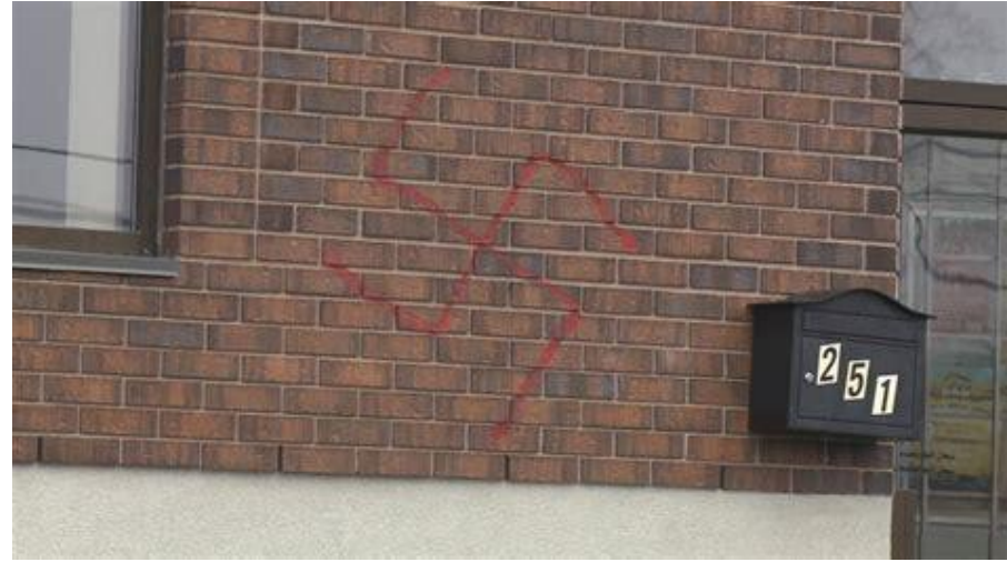
A spray-painted red swastika is seen on the exterior brick wall of Ottawa Mosque on Northwestern Ave. on Friday, Nov. 18, 2016.