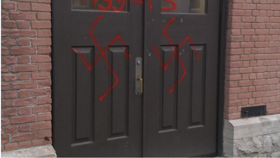
Red swastikas and racial slurs were spray-painted on the doors of Parkdale United Church overnight Thursday, Nov. 17, 2016.