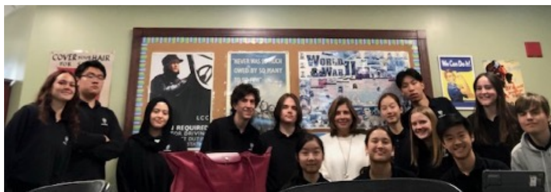
Grade 10 students at Ashbury College are learning about the Holocaust.