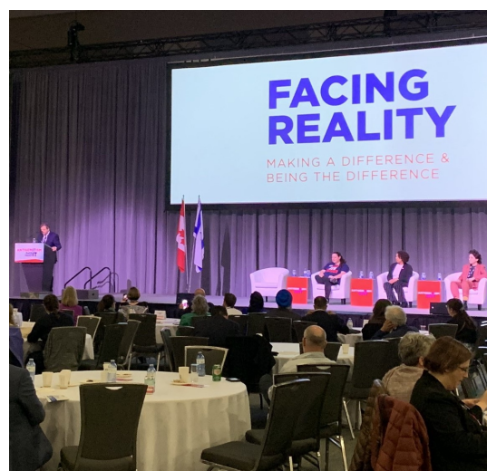
Antisemitism: Face It, Fight It presentations

Close to 1,000 members of Jewish communities from across Canada and friends joined the two-day CIJA Conference, Antisemitism: Face It, Fight It , in Ottawa on October 13 and 14. On everyone's mind was the horrific attack by Hamas terrorists on the people of Israel one week earlier. Read more