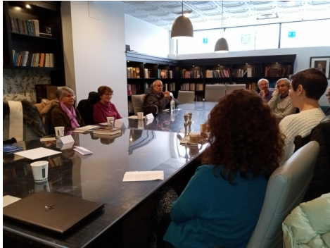
Through Their Eyes participants during a meeting in December 2023