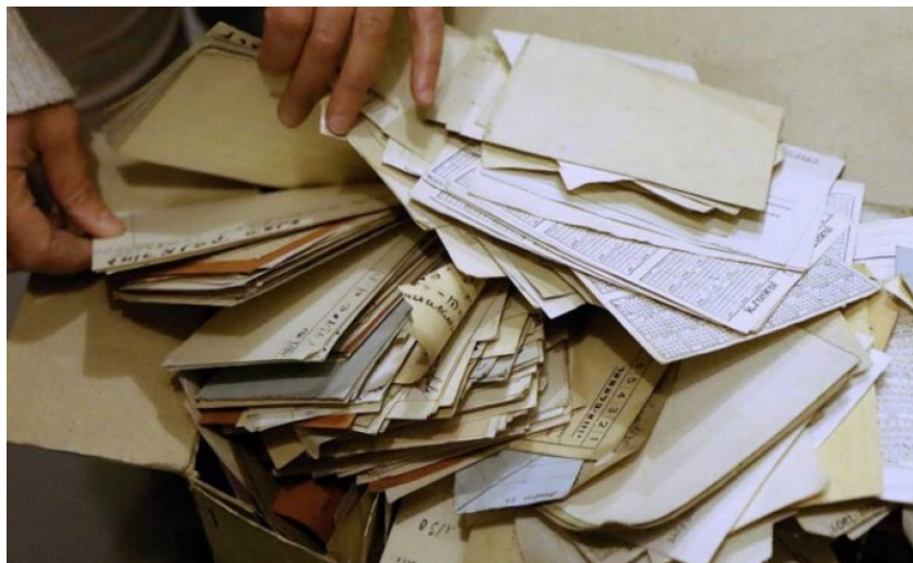
Documents for preservation

How can we show the human impact of a number like six million Jews perishing in the Holocaust?