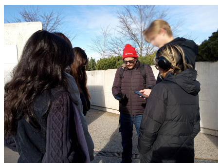
Students from Sir Robert Borden High School using the IWalk App at the NHM