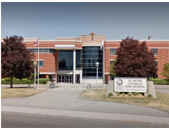
St. Peter High School