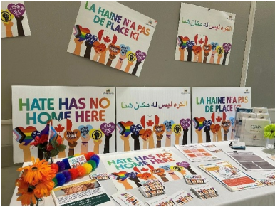
Materials on display at the Building Bridges event.