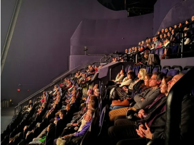
A spellbound audience views Liliana .

The Embassy of Italy, in cooperation with CHES, hosted the North American premiere of the film, Liliana , with special guest, film director Ruggero Gabbai , on Sunday, February 2 nd , on the Canadian Museum of History's big screen. Read more