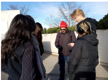
Students from Sir Robert Borden High School using the IWalk App at the NHM