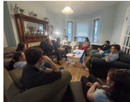
A Zikaron BaSalon was held at Hillel House.

Building on the success of previous years in commemoration of Yom HaShoah and in the spirit of Holocaust remembrance, CHES was honoured to bring the tradition of Zikaron BaSalon (Remembrance in the Living Room) into Ottawa homes once again. Read more