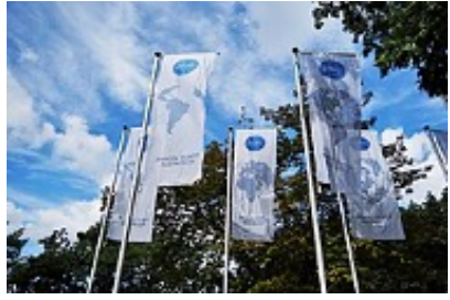
Flags of the DAAD on Kennedy Allée, Bonn